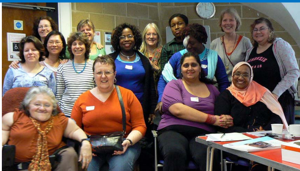
A Parents for Inclusion course, accredited by the Open College Network, funded by City Bridge

Gain nationally recognized Certification for what you do well and feel strongly about - become an agent of change